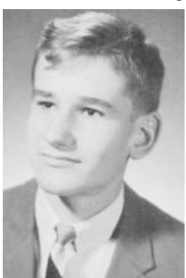
Occupation: Owner, Construction Management Service